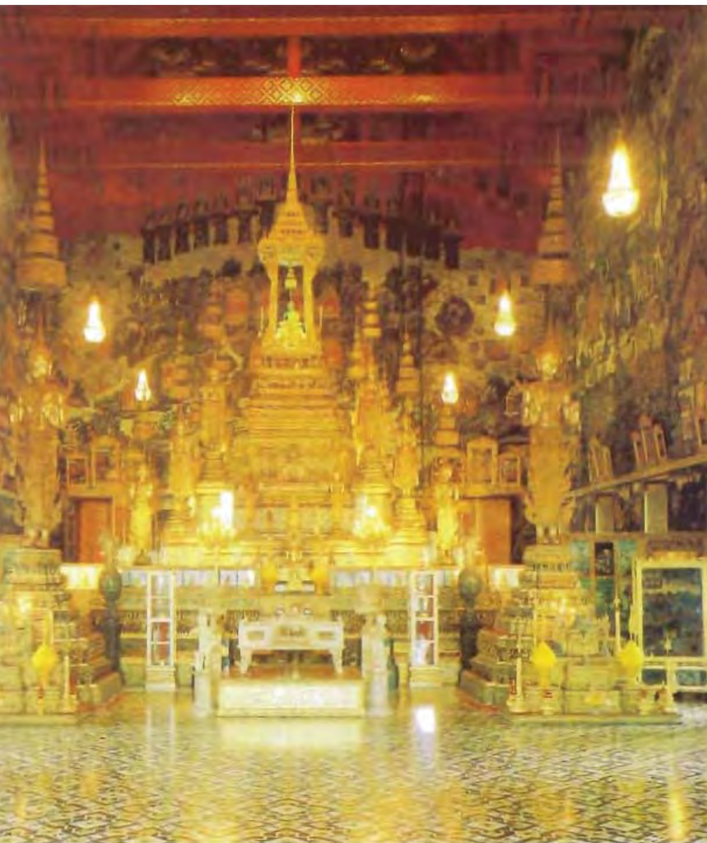
1: Inside the ubosoth of the Temple of the Emerald Buddha. The Emerald Buddha is wearing his rainy season costume.